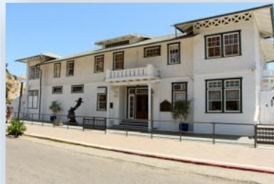
The Tuna Club | California Historical Landmark No. 997