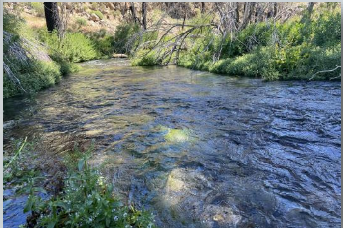
LYELL CREEK, Yosemite