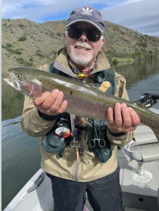
"This Rainbow was a typical sized trout caught in Mid June at Hauser Lake Montana. Most of the trout were caught on small midges under an indicator". - John Riparetti