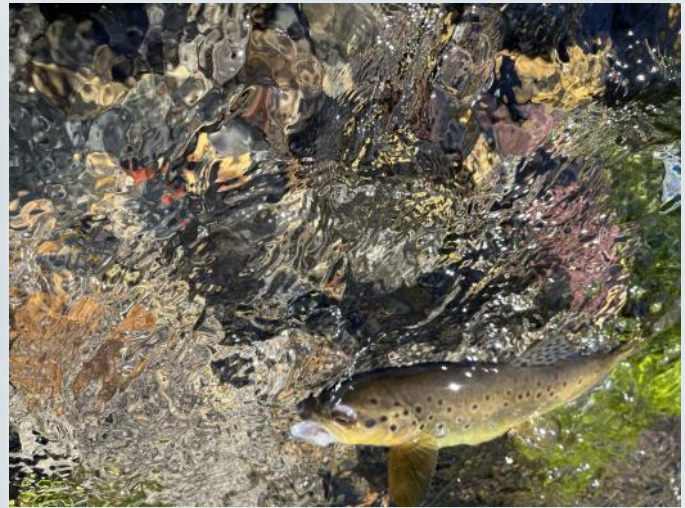
KEEP 'EM WET! (above)